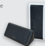
2x Multibox of your choice