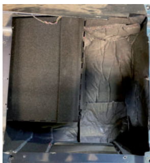
(Also suitable for built-in safe) (Note loss of space!)