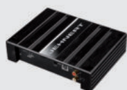
5-channel DSP amplifier