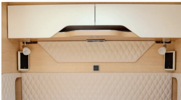
Multibox 5500 Sleeping area