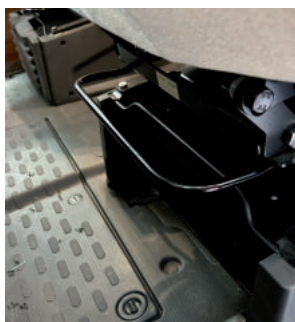
Subwoofer »17011« installed under the driver's seat