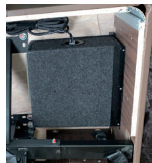
Subwoofer »17011« installed under the seat bench of a motorhome