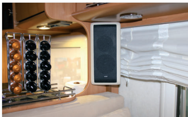
Multibox 7000 living area