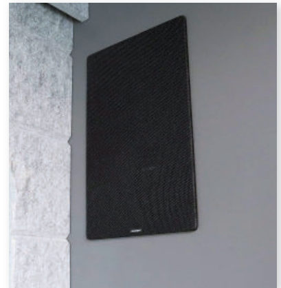
Multibox PleX-Plade 6700 entrance area Extremely flat assembly