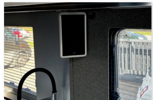
Multibox 5500 living area