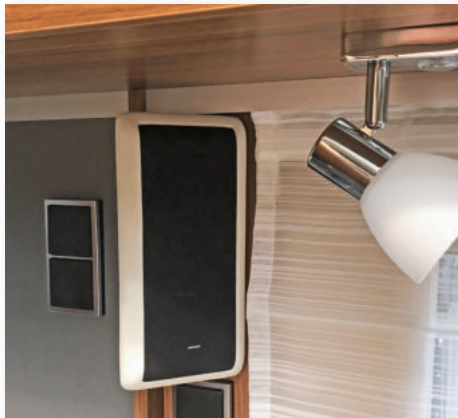
Living room box 7000 living area „cream white“ Corner mounting

To match the colour of your interior, you can choose between 8 different imitation leather colours. The housings are made of high-strength fibreglass.