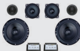
3-way cab system