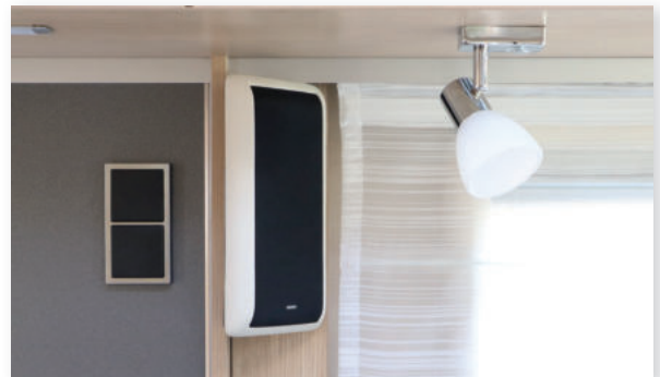
Multibox 7000 living area