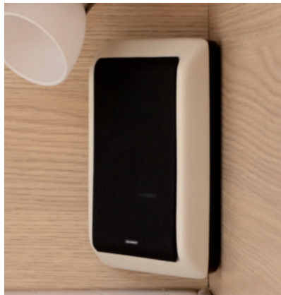
Living room box 5500 Living area „beige natural“ corner mounting