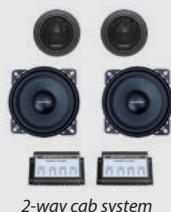
2-way cab system